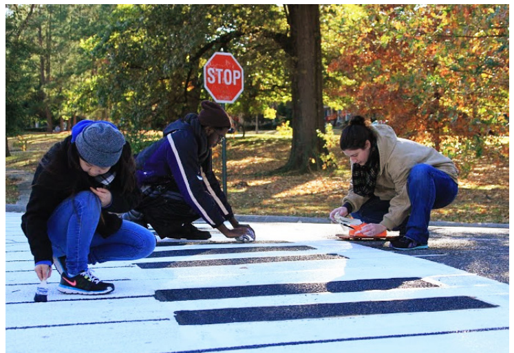
In November, students from Memphis College of Art painted three temporary crosswalks in the park as part of a partnership with Levitt Shell. Location and configuration of crosswalks is one topic a mobility plan will address.