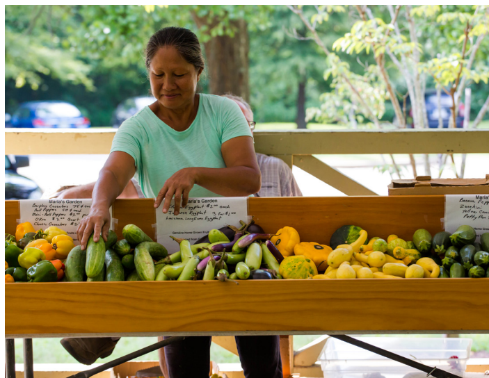
Marla's Garden and dozens of other vendors offer fresh produce and flowers.

While we had a fantastic two-month kickoff this fall, expect to see and hear a lot more of the market next year. In October, the USDA announced that the Overton Park Community Farmers Market would