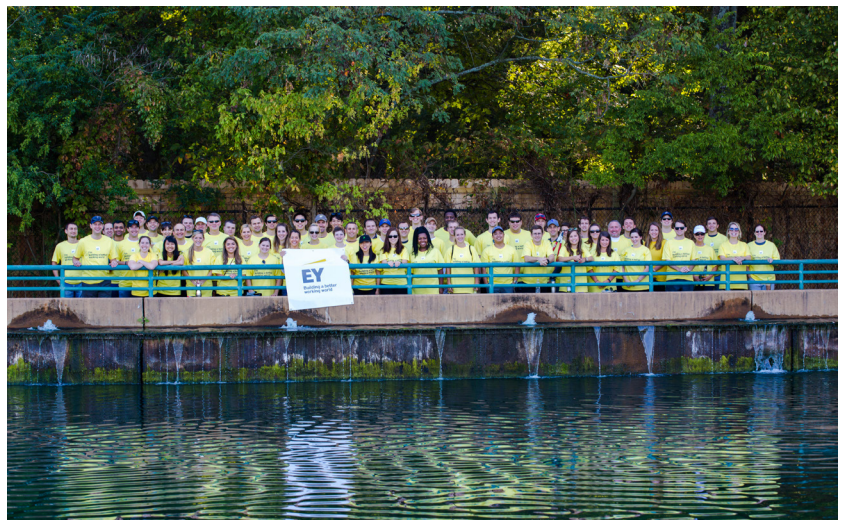
Volunteers from Ernst & Young painted railings at Rainbow Lake and removed kudzu in the Old Forest.

Our largest volunteer event was Ernst & Young's EY Connect Day, a global event that sends employees into their communities for a day of service. Our crew was so large that they got three big tasks done: a trail cleanup, repainting all the chipped railings around Rainbow Lake, and a battle against kudzu deep within the Old Forest. Afterwards, they celebrated with pizza at Rainbow Lake Pavilion and reflected on a job well done.